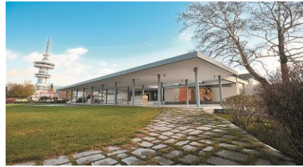
THE ARCHEOLOGICAL MUSEUM

Museum with exhibits from pre - historic, classic and roman times, the Museum of Byzantine Culture, the White Tower Museum, the War Museum, the Folkloric and Ethnologic Museum, the Museum of Ancient Greek Byzantine Instruments, the Museum of Macedonian Struggle, the Municipal Art and the Gallery of Macedonian Studies, the Museum of Cinema and the Museum of Photography that organize events and exhibitions on topics relevant to the content of their activities.