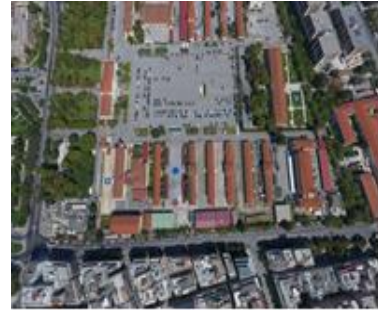
TOP VIEW OF THE CAMP