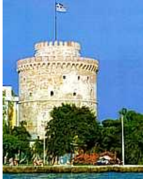
THE WHITE TOWER

a. The ancient King of Macedonia, Kassandros, married the stepsister of Alexander the Great, Thessaloniki, and named the city after her, uniting 26 small settlements that pre - existed around Thermaikos Gulf. The archaeological monuments of the city are an indisputable proof of the brilliant and glorious past of Hellenism extending back to about 2.500 years. Thessaloniki became an important gateway of the Roman Empire, an early springboard for the expansion of Christianity in Europe and a vital centre of the Byzantine Empire. Hellenic Army units liberated Thessaloniki and the wider Macedonia region from the Ottoman Empire domination during the Balkan Wars of 1912 - 1913.