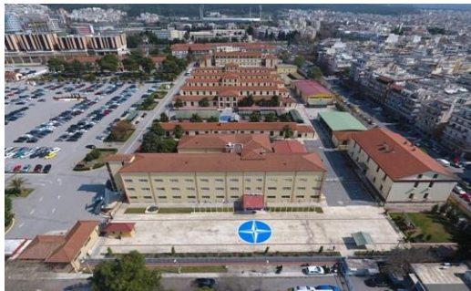
THE NRDC - GR

a. In case of travelling by airplane, the "MACEDONIA" International Airport is the closest airport, located 15 km east of the Camp. There is a taxi station outside the airport and several buses start their route from there (Recommended bus route to reach the Camp: Bus No 01X, Town Hall station). For more information visit: