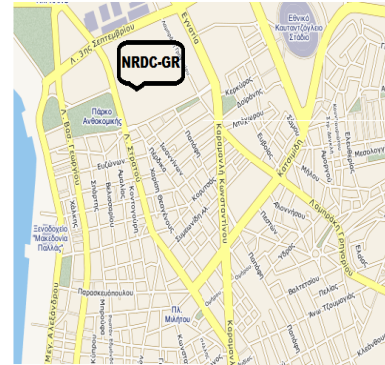
TOP VIEW OF THE CAMP