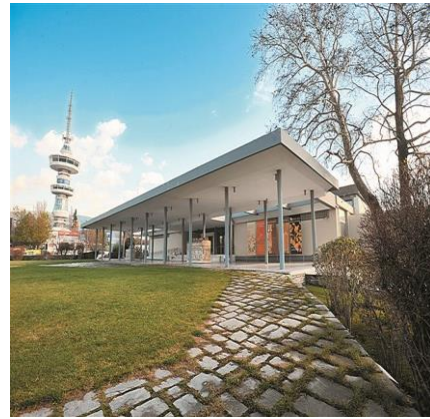
THE ARCHEOLOGICAL MUSEUM

Museum with exhibits from pre - historic, classic and roman times, the Museum of Byzantine Culture, the White Tower Museum, the War Museum, the Folkloric and Ethnologic Museum, the Museum of Ancient Greek Byzantine Instruments, the Museum of Macedonian Struggle, the Municipal Art and the Gallery of Macedonian Studies, the Museum of Cinema and the Museum of Photography. All of them organize events and exhibitions on topics relevant to the content of their activities.