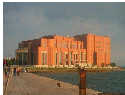
THE CONCERT HALL

Cultural life in Thessaloniki is very rich. A variety of cultural events organized by a number of cultural institutions and the Municipality of Thessaloniki are keeping the Galleries and the Theatres crowded all year round. It is worth mentioning the Cinema, Book and Song festivals, the International Film festival and “Dimitria” - a big festival of musical and theatrical events.