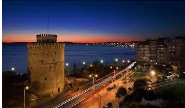
THE WHITE TOWER

a. The ancient King of Macedonia, Kassandros, married the stepsister of Alexander the Great, Thessaloniki, and named the city after her, uniting 26 small settlements that pre - existed around Thermaikos Gulf. The archaeological monuments of the city are an indisputable proof of the brilliant and glorious past of Hellenism reaching back to about 2.500 years. Thessaloniki became